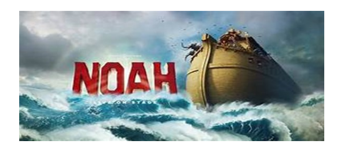
LANCASTER, PA BUS TRIP SIGHT AND SOUND THEATER June 3-6, 2025

For further information about these ministries, (don't be shy!), contact Ellie Stivers: 315-751-1156 or Elaine Ruckdeschel: 315-288-4757.